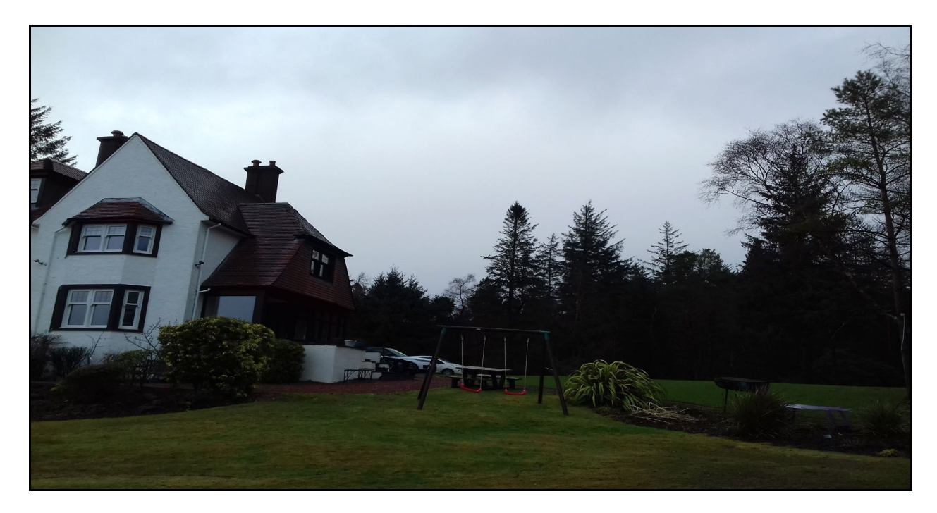
View from south-east part of site across to the existing house and the tarmac area beyond

Both the adopted and draft PAAN5 state that outdoor seating areas should not be of a size that will afford residents the opportunity of undertaking a wide range of activities over extensive periods to the extent that regular activity may impinge upon the enjoyment of neighbouring gardens. Both the adopted and draft PAAN5 go on to indicate that screening will generally be required, however if this is more than 2.5m high within 2m of a boundary or results is a loss of light to a room in a neighbouring house, then the proposal will not be supported. The proposed balcony and ground level terrace are reasonably large and therefore could be used over extensive periods. Given their positions and their distances from the south boundary and to the property to the south combined with the existing intervening trees it is not considered that significant overlooking will occur.