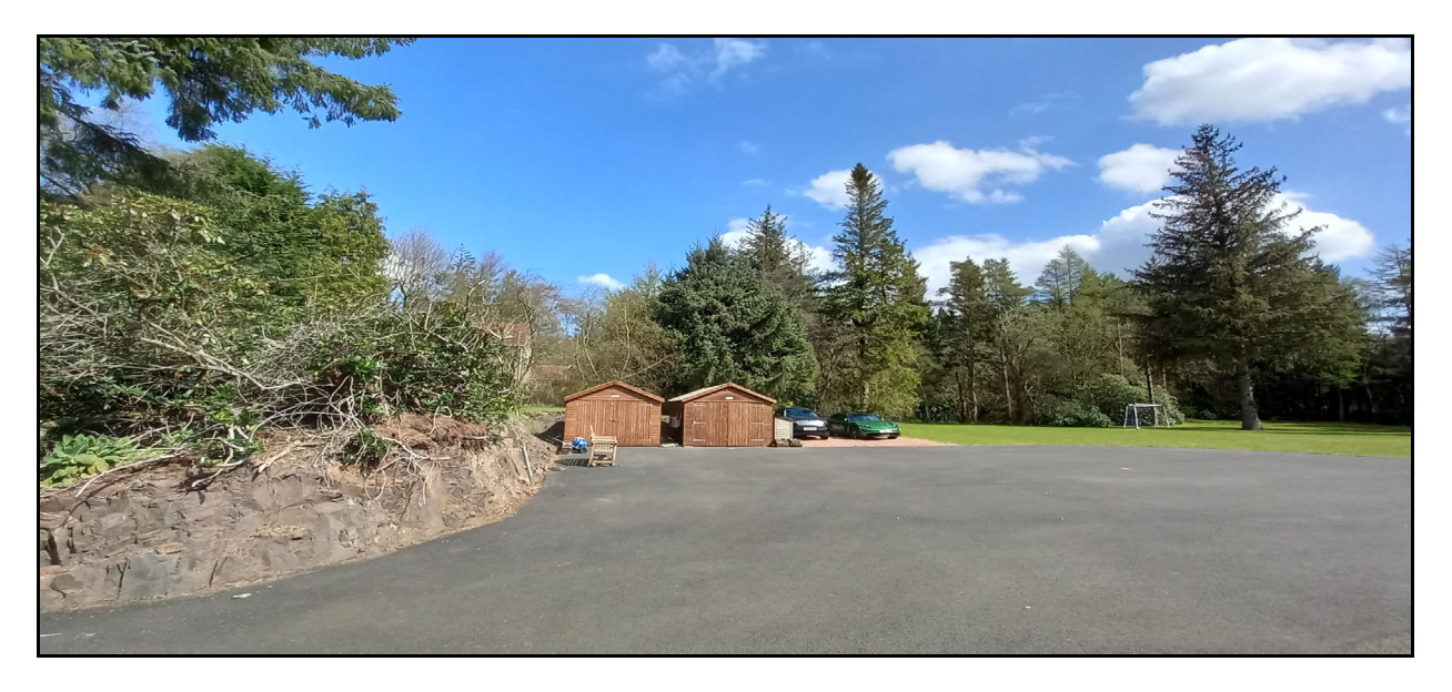
View across the tarmac area in a north-east direction to the boundary with Mosswood

The detached building now being applied for can be readily accommodated at this extensive site without resulting in overdevelopment. The principal elevation of the proposed detached building faces towards the existing house and views from the dormer windows on the front roof slope overlooks the tarmac area and onwards towards the existing house. There will be no significant loss of privacy in this direction. It should be noted that a material start could be made on planning permission 19/0068/IC before 31st March 2023 and the extent of possible overlooking from the dormer windows at the rear facing towards Mosswood is likely to be greater compared to the rooflights that are now proposed on the rear roof slope. The base of the rooflights on the rear roof slope are approximately 1.7m above first floor level. This is considered to be sufficiently high that significant views towards the neighbouring property to the north at Mosswood will not occur from the first floor level bearing in mind the rooflights are relatively limited in size and trees along the boundary assist is screening views. The inclusion of rooflights on the rear roof slope of the detached building compared to dormer windows is considered to be an improvement in terms of addressing potential overlooking.